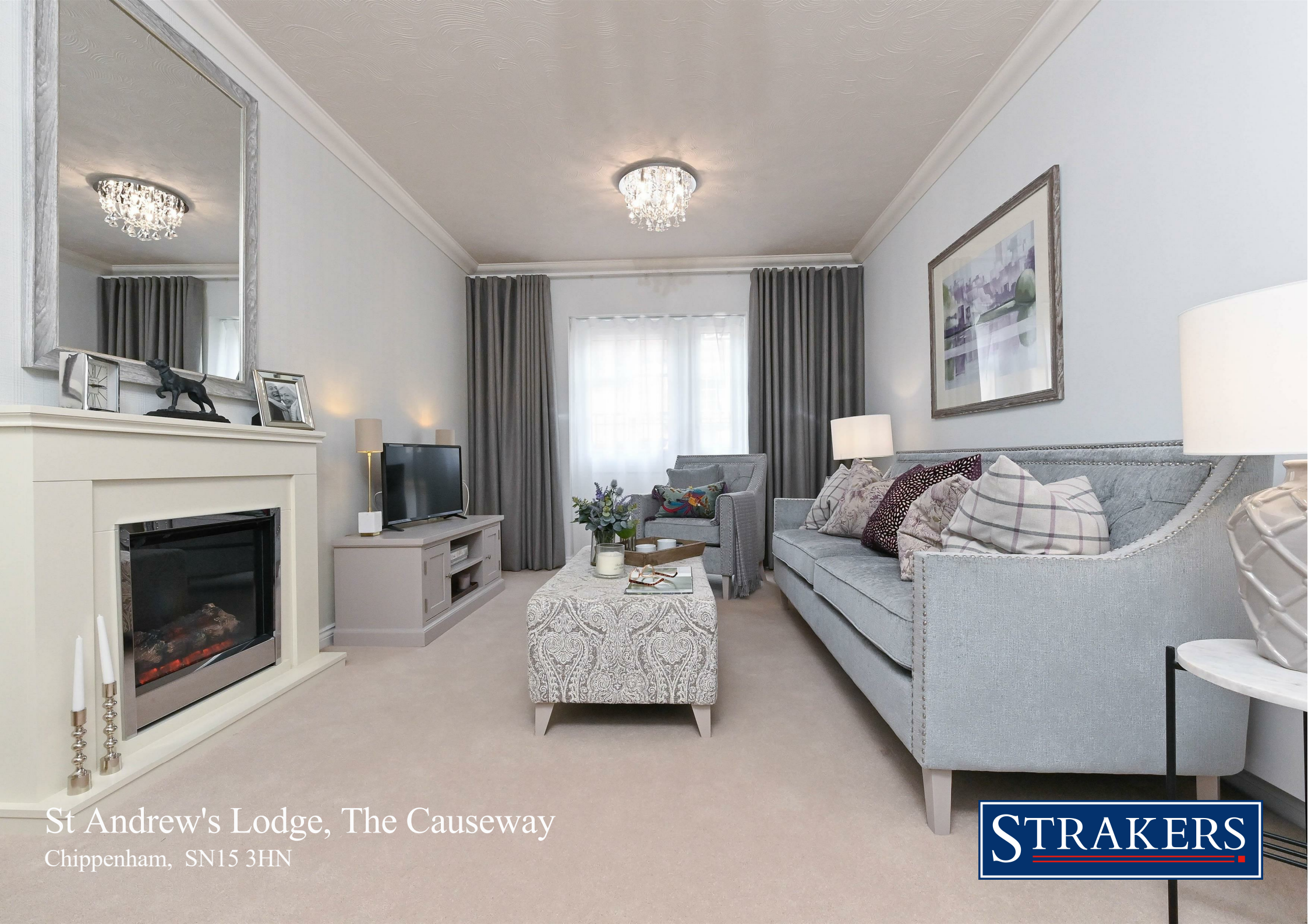
St Andrew's Lodge, The Causeway Chippenham, SN15 3HN